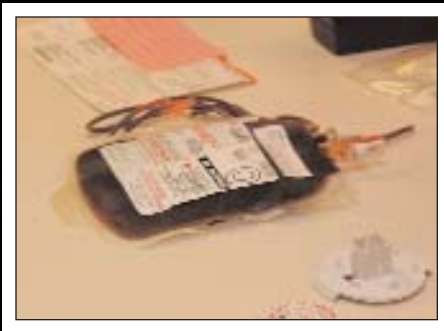
The inset images above show several steps in the testing, typing, and labeling of donated blood. The background image is of magnified red blood cells.

B lood makes the headlines almost every day: There's not enough of it. And what there is may be contaminated. Some hospitals plead for donors. Others postpone elective surgery. Two patients in Florida contract HIV from a transfusion. West Nile virus is found in some samples of donated blood. Bacteria-infected batches of blood are destroyed. White particles are discovered floating in bags of blood in Georgia. Are they infectious agents? Pieces of the plastic bags, disintegrating from the inside out? Or just clumps of blood cells?