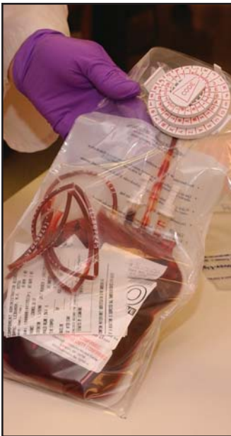
The Bloodloc system is used by only 40 or 50 hospitals nationwide.

The Bloodloc resembles a giant decoder ring and is affixed to each unit of blood.