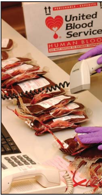
A shipment of red cells is logged in using computerized bar-coding.

DHMC gets its blood from three different sources, including its own blood-donor room.