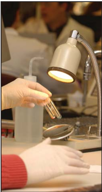
Blood-typing, pictured here, is a key link in the blood-supply chain.

Someone receives the wrong kind of blood about once in every 12,000 transfusions.